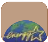
Energy Star Certified